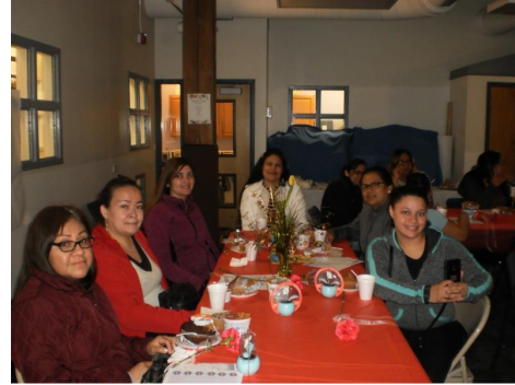
Taylor Center For New Experiences