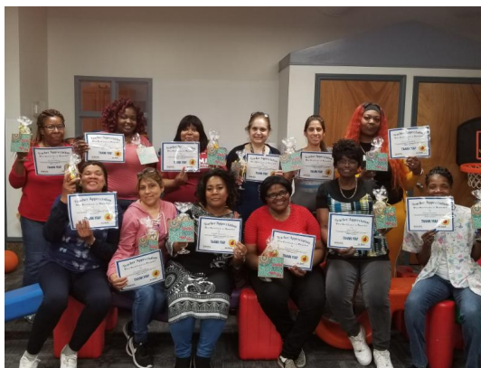
Paulo Freire Family Center

Our moms and staff were pampered this month for Mother's Day and Teacher Appreciation Day at our four early education centers. Teachers and mothers of the children enrolled in our centers, enjoyed massages, gift bags, manicures, activities, and food as a small thank-you for all they do. Thank you, moms!