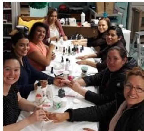
Guadalupano Family Center