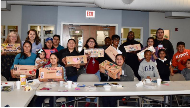
Nia Family Center