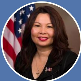
Graham Taylor Champion of Change Award U.S. Senator Tammy Duckworth