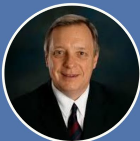
Graham Taylor Champion of Change Award U.S. Senator Dick Durbin